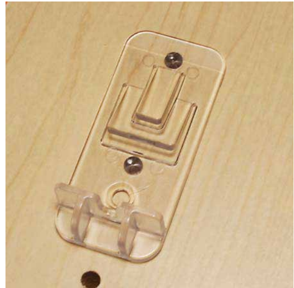
T-803 Shear Test