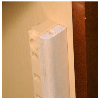
1.25" Molding Strip for Framless Cabinets