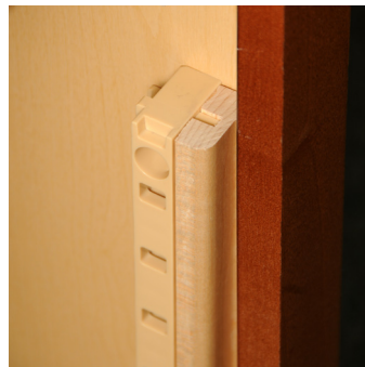
1.25" Molding Strip with Stand-Off