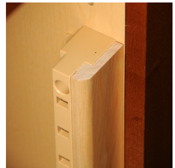
2" Molding Strip