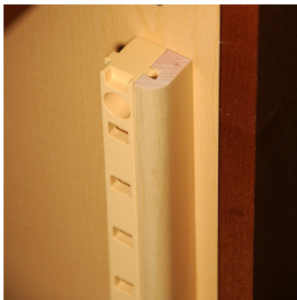
1" Molding Strip